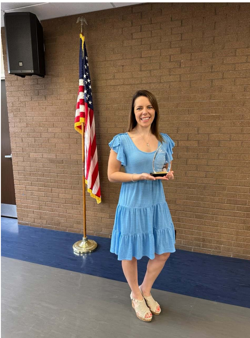
Our club president with the Platinum Award received at the District Conference.