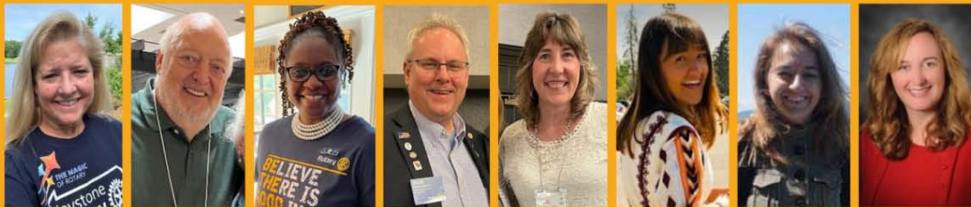
Pictured above: Keystone Rotary Board of Directors

Reach out to us at KeystoneRotaryConnects@gmail.com