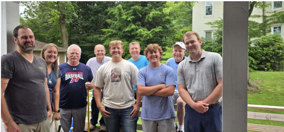
Work day photo from Ellen's House project. Supplies were rearranged as we prepared the space for carpet installation. The project is nearing the end as the child enjoyment space will then be completed with cabinet installation and activity centers.